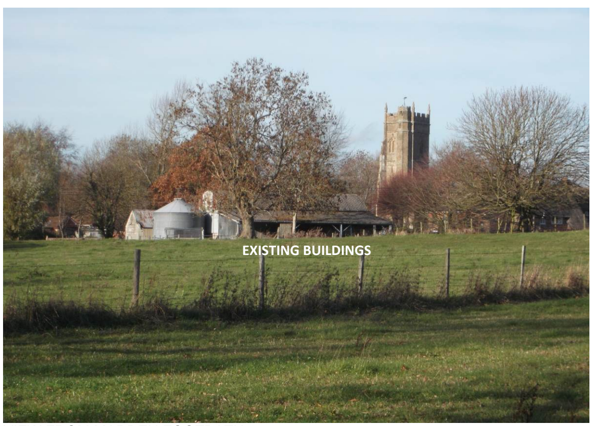
VIEW FROM MARDEN FOOTPATH 3

Whilst the dwelling would be 2 storeys, the pitched roof would be flat-topped and the span of the building would be 15.25m rather than the recommended 6m. The overall scale is thus substantial and does not reflect the modest scale of development anticipated by the Conservation Area Statement. As noted by the Conservation Officer, together with its non-traditional Georgian styling, this would disrupt the visual and physical hierarchy of buildings within the village, and particularly those closest to the site, such as the opposite grade 2 Grange Farmhouse and the Old Vicarage. The building would also be prominent in views towards the village, and disturb views of the All Saints Church, on the approach to the village along the public footpath from the east.