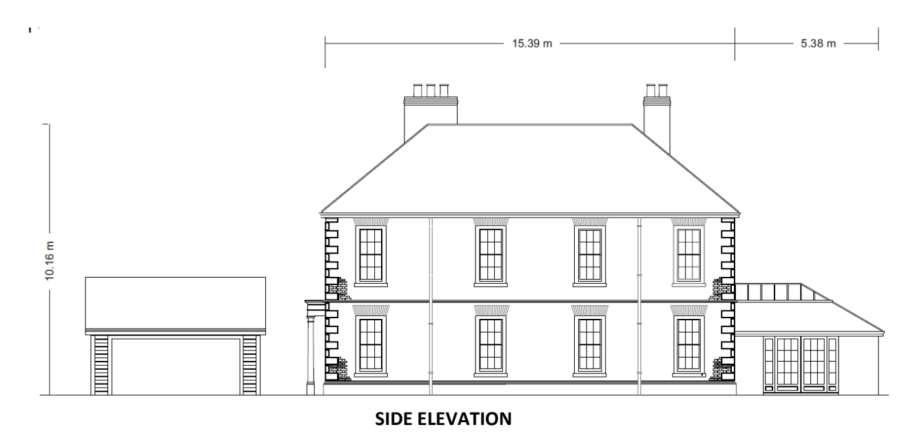
A 2-bay car port would be located to the front/ side of the dwelling, and the curtilage of the dwelling would be extended beyond the area of the existing farmyard by c. 200m².